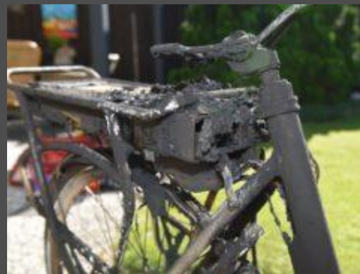
Damage after fire

During the decomposition of these chemicals, many dangerous gases are released (including hydrogen fluoride, lithium hydroxide, hydrochloric acid) which are harmful to humans and the environment. lithium-ion fire is not a metal fire, but a chemical decomposition reaction, during this reaction a lot of energy is released. This creates a lot of heat, the decomposition reaction spreads further into the cell and can also cause the decomposition reaction in surrounded cells. This is also called a "thermal runaway". During a thermal runaway, the pressure and temperature in the cell will increase, causing the cell to burst open and shoot burning parts away. This allows a fire to spread quickly. A battery usually contains more than 40 cells, which together contain so much energy that they are almost impossible to extinguish. It may even take several days for the decomposition reaction to stop. The decomposition reaction can also resume later. Example: a lithium-ion battery started smoking again and developing heat 3 weeks after it had been on fire.